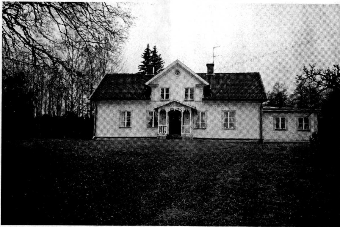
The house where August Danielsson was born. Years later, in America, he changed his surname to Sandburg.