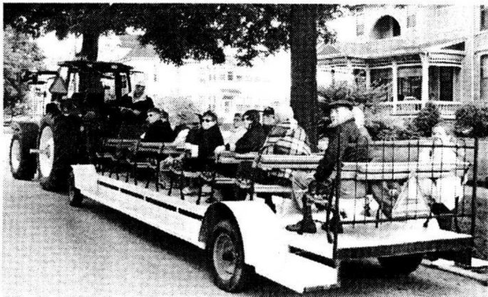
The Galesburg Historical Society loaned its tram for the tour and Jim

Sunday, June 8th was windy, not very warm and somewhat damp, but a number of hardy souls turned out for the tram tour conducted by Rex Cherrington. The tour included sections of Galesburg frequented by Carl Sandburg in his youth. Sites described included the Brooks Street Fire Station, Lombard College, Fairgrounds and homes of well-to-do citizens and the houses where the Sandburg family lived.