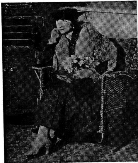
Amelita Galli-Curci at Augustana College, Rock Island, Illinois, May 17, 1917

Her success led to tours in the United States and a recording contract. Her recording of "Caro Nome" sold ten thousand copies in Chicago alone. She was paid as much as $15,000 (equal to more than $204,000 in today's dollars) for her opera appearances.