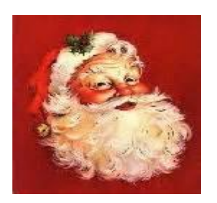
Happy Holidays to All!

From their gunny sacks the twins showed their parents a left-handed monkey wrench and a right-handed monkey wrench. As time went on, the mother and the father wondered how their boys would turn out, and the father repeated what he said when they were born on Christmas Eve, "Twice times twice is twice."