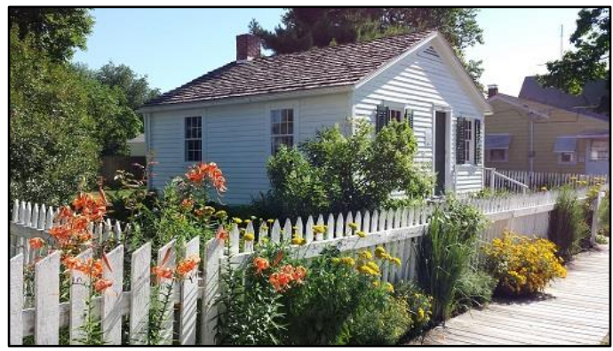
Sandburg Birthplace Cottage, July 27, 2014

-- From the Illinois Associations of Museums