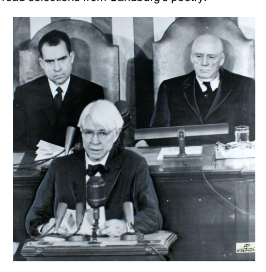
Sandburg Addressing Joint Session of Congress on February 12, 1959.