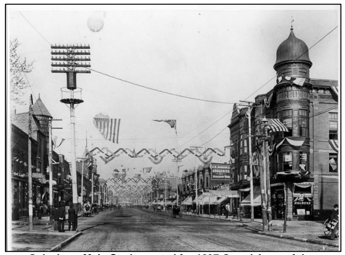
Galesburg Main St. decorated for 1897 Grand Army of the Republic Convention. Building on right at 349 E. Main St. later was Odd Fellows Building. Now Galesburg Antiques Mall Co.

Among the earliest documentation we have is an 1897 photograph of this building when Main Street was well decorated in a patriotic motif for a Grand Army of the Republic Convention, which included a parade down Main Street. Other documentation lists the Scandinavian Mutual Aid Association as headquartered in this building in 1897. The building is on the list of works attributed to architect William Wolf. No elaboration about this work, including the year of Mr. Wolf's design, appears to exist. A sign in a second floor window of the round turret, visible in the 1897 photo below, states the building was the location of the armory of Company C of the Sixth Illinois National Guard. This was the organization that Carl Sandburg joined in 1898 when he went off to the Spanish-American War. Over a period of years Mr. Berggren acquired sole ownership of the building, and no doubt he was the most influential of the partners.