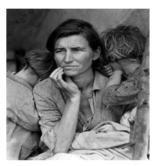
Dorothea Lange's 1936 Photograph "Migrant Mother" appeared in Family of Man.

poetry. A book was issued entitled Family of Man that has now sold over four million copies. The book has all 503 images from the exhibit. Sandburg wrote the prologue.