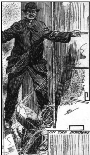
Riding the bumpers.

He started out “riding the bumpers” between cars as the train rattled along through the dead of night. Eventually feeling tired, Sandburg knew from previous travels that he needed to find an empty box car for his own safety. Unable to find such accommodations, he decided to climb on top of a car and ultimately fell into a deep sleep. When he awoke in broad daylight, he found the train stopped some fourteen miles east of Pittsburgh in the town of Wilmerding. Had he known its political leanings, he might have taken the time to explore this borough of 5,000 that revolved around the Westinghouse Air Brake Company.