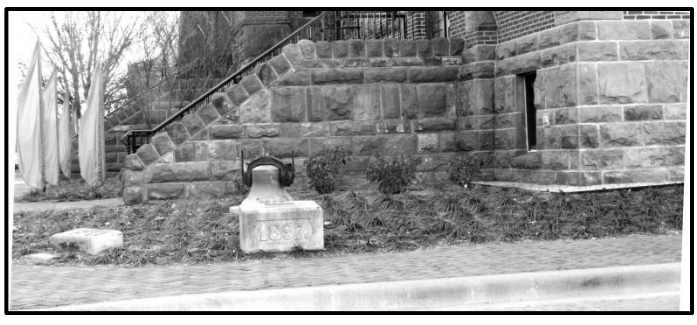
Lombard College Garden, NW Corner, Alumni Hall, Knox College

A newspaper clipping from 1955 did not identify the person who personified Lombard's "Old Main," but the words are most moving, and we will close on this somber note.