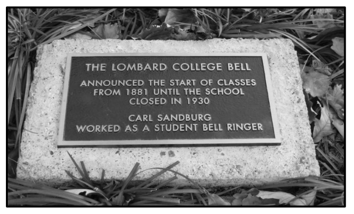
Marker in Lombard College Garden at Knox College