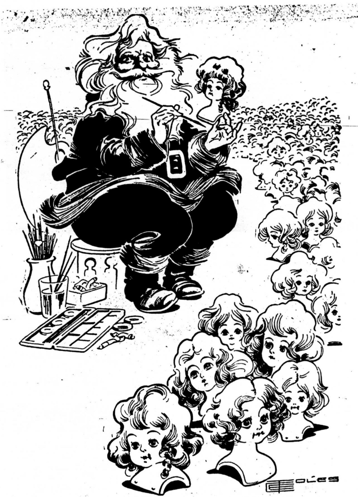
IN SANTA'S DOLL FACTORY. - HE PREPARES TO MAKE GLAD THE HEARTS OF GOOD LITTLE LADIES.