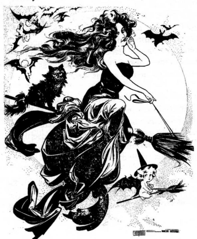
THE SPIRIT OF HALLOWE'EN

This illustration for the holiday appeared on the front page of the newspaper. "The Spirit of Halloween" has a resemblance to a young Elizabeth Taylor of acting fame much later in the 20<sup>th</sup> century.