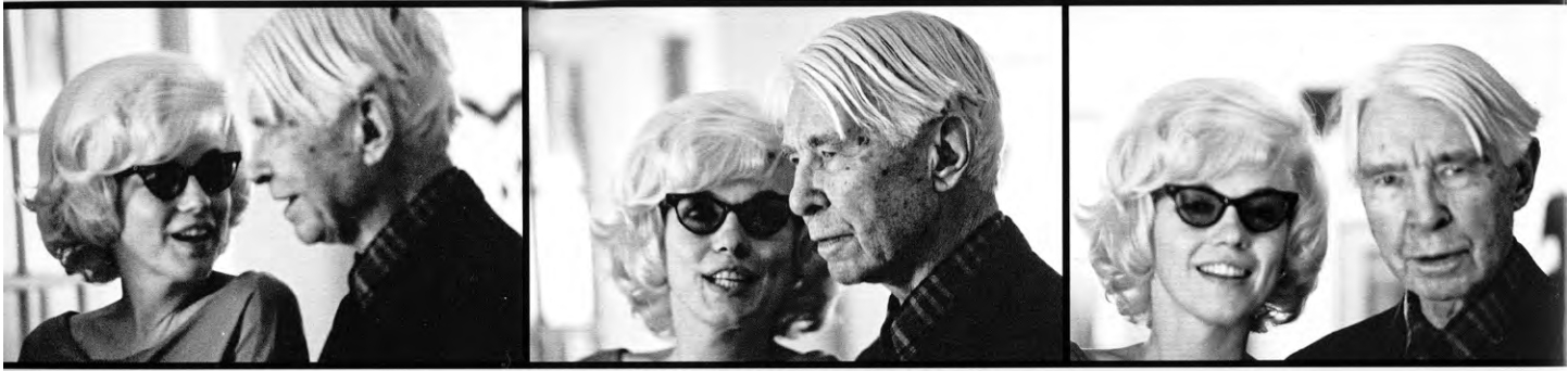
THE VISIT SERIES TRIPTYCH #1 - 37" x 14"