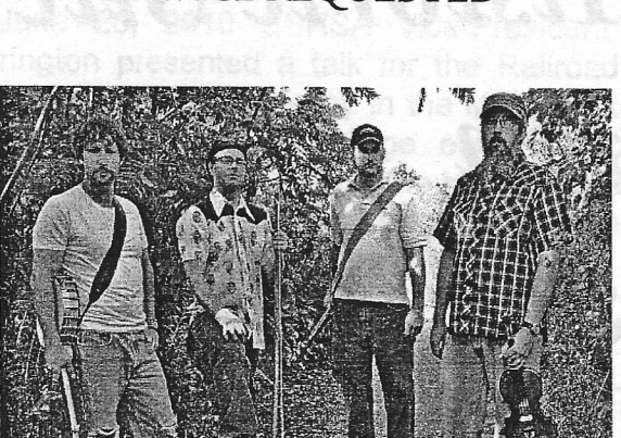
The Gilded Bats Songbag Concert Series performers September 25th Concerts are the last Saturdays at 7pm at The Carl Sandburg Visitors' Center Barn