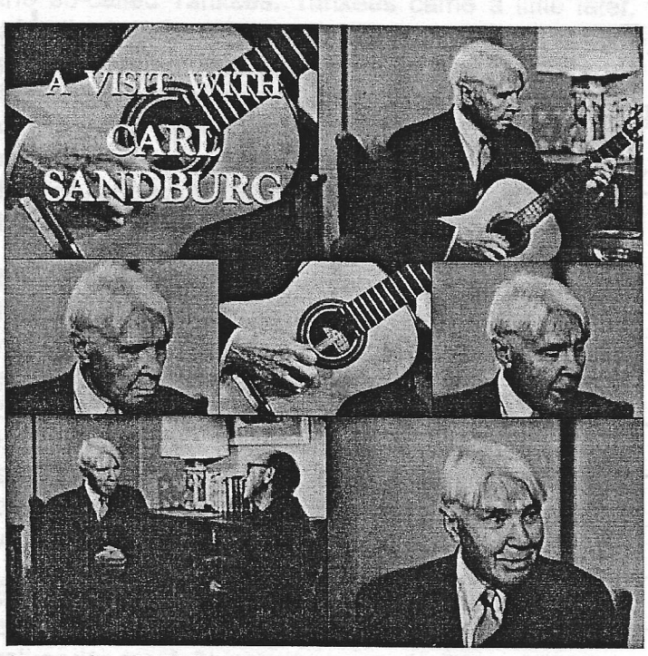
Buy the DVD of this newly restored classic television interview from 1953.

$15 plus tax at the Carl Sandburg State Historic Site $20 postpaid to P.O. Box 108, Galesburg, IL 61402