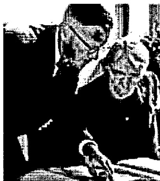
Sandburg studying genealogy in Sweden, 1959