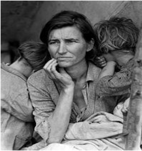
Dorothea Lange's 1936 Photograph "Migrant Mother" appeared in Family of Man .

poetry. A book was issued entitled Family of Man that has now sold over four million copies. The book has all 503 images from the exhibit. Sandburg wrote the prologue.